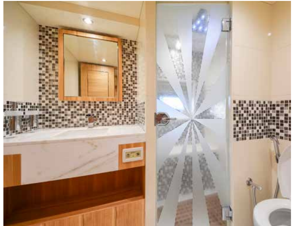
Twin Guest Cabin | Twin Guest Head