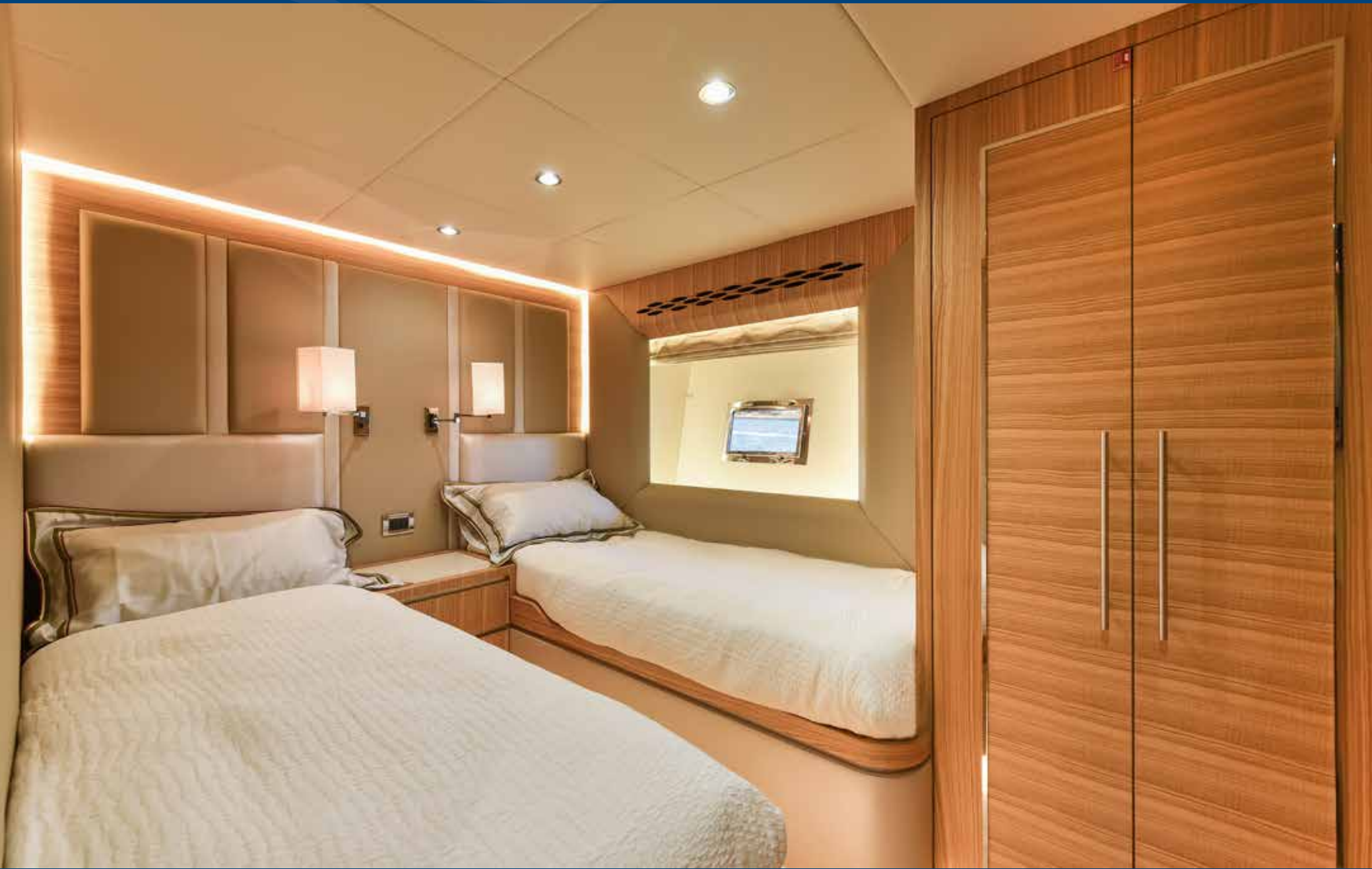
Twin Guest Cabin