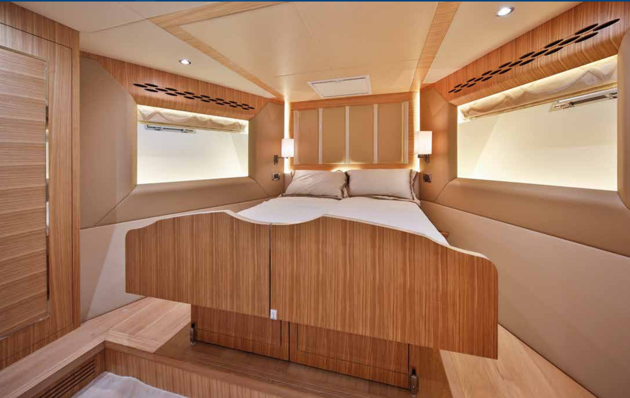
Forward VIP Guest Cabin